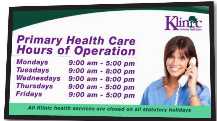
Television in Wait Room at Klinik on Portage Avenue

There were 217 employees and 238 trained volunteers providing services throughout the year. Last year Klinik had 4 employees retire whose combined years of service totaled 84. Klinik awarded twelve 5 year pins, eight 10 year pins, two 15 year pins, two 20 year pins, one 25 year pin, and one 35 year pin. Forty-seven percent of Klinik employees have worked at Klinik for at least 10 years. These numbers demonstrate the dedication of our volunteers and employees and we thank them for their ongoing commitment.