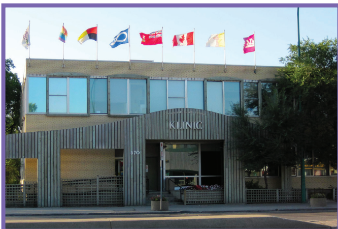
Klinic at 870 Portage Avenue

I would like to take this opportunity to thank staff for their continued dedication to their work at Klinic.