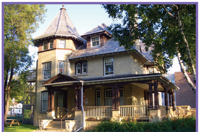
Klinic on Broadway at 545 Broadway