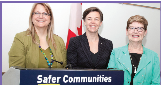
Minister Leitch announces funding Status of Women Canada at a Press Conference on April 30, 2015

Community Health & Education Services had a very busy year providing resources and supports to communities throughout Winnipeg and Manitoba. Responding to the issue of sexual violence, Klinic was awarded a grant from Status of Women Canada for the project: A Manitoba and Western Canadian Collaboration to Preventing and Responding to Sexual Violence Against Women and Girls . The goal of this project is to identify the barriers to comprehensive sexual assault response services for women in Manitoba especially those residing in rural, remote and northern communities, and to develop strategies to address these barriers. In addition the Sexual Assault Crisis Program provided ongoing consultation and support to the University of Winnipeg, University of Manitoba and Providence College in the development of their respective sexual assault response protocols.